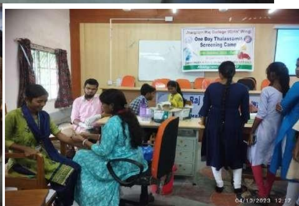
Thalassemia Screening test Camp on 04.10.2023