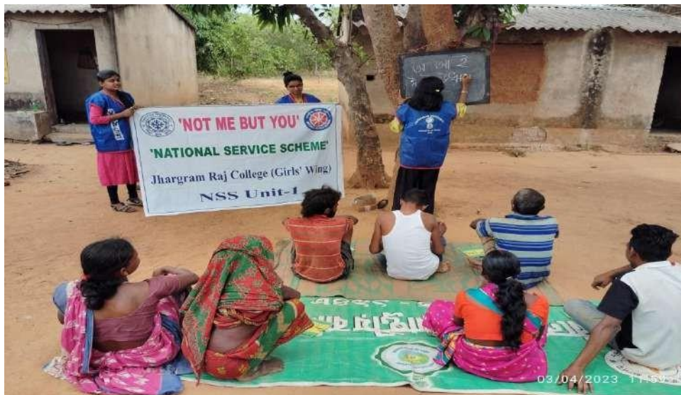
Adult Literacy Programme at Pukuriya Lodha sabar Para on 03.04.2023