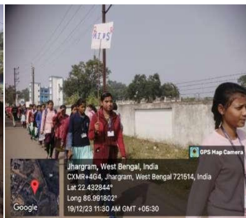
AIDS awareness Rally on 19.12.2023