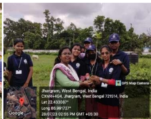
Observed Aranya Saptaha 2023