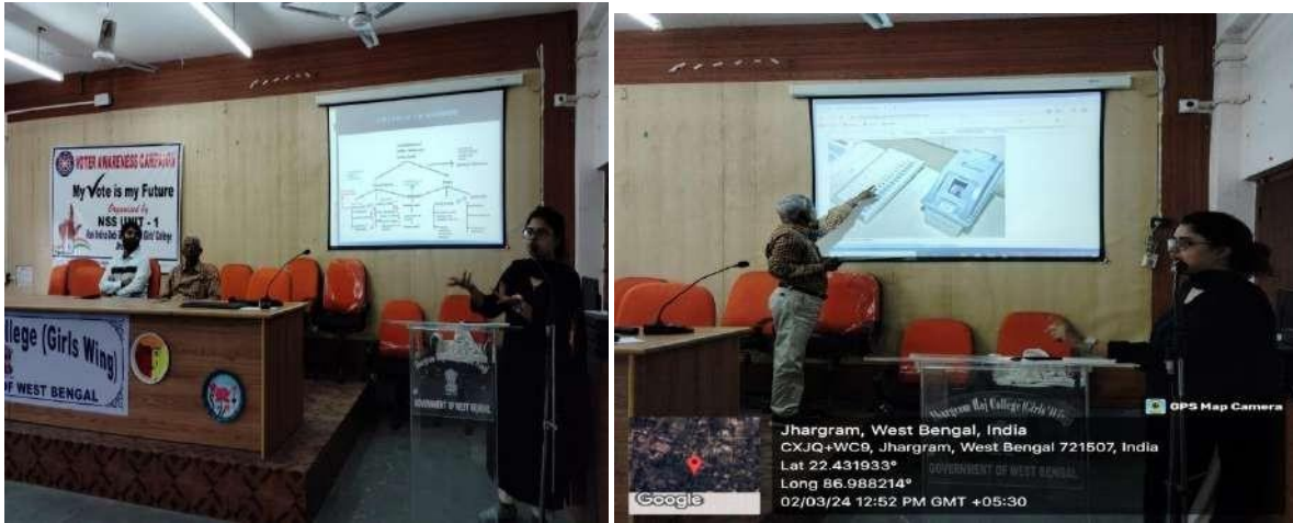
Voter awareness camp on 02.03.2024