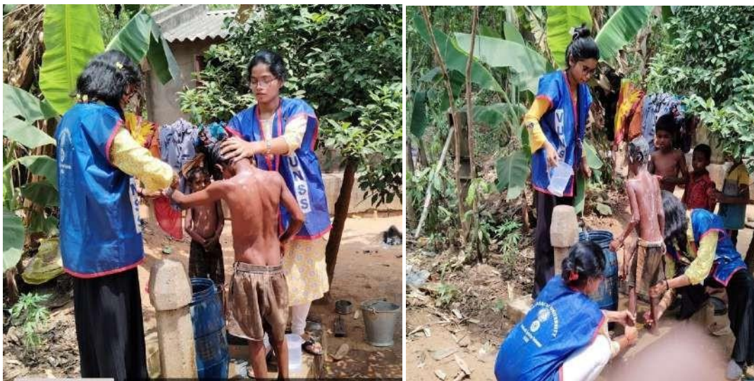
Health and hygiene program at Pukuriya, Lodha Sabar Para on April 13, 2023.