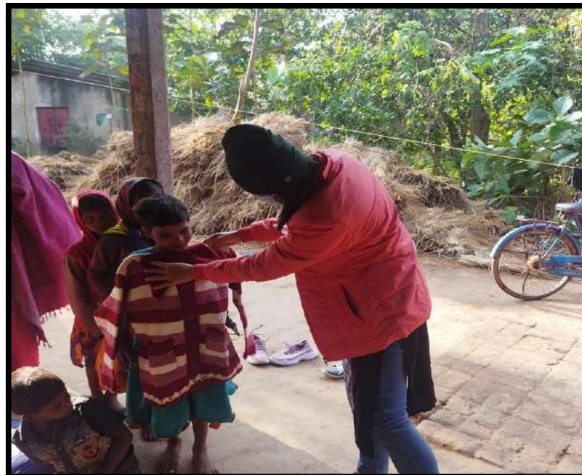
Winter garments being distributed to the students