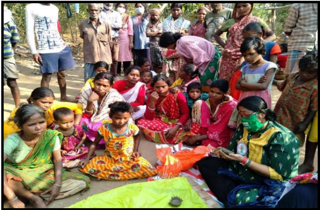
Lamp making training at Pukuria village by an NGO named Vorgo Reiki House