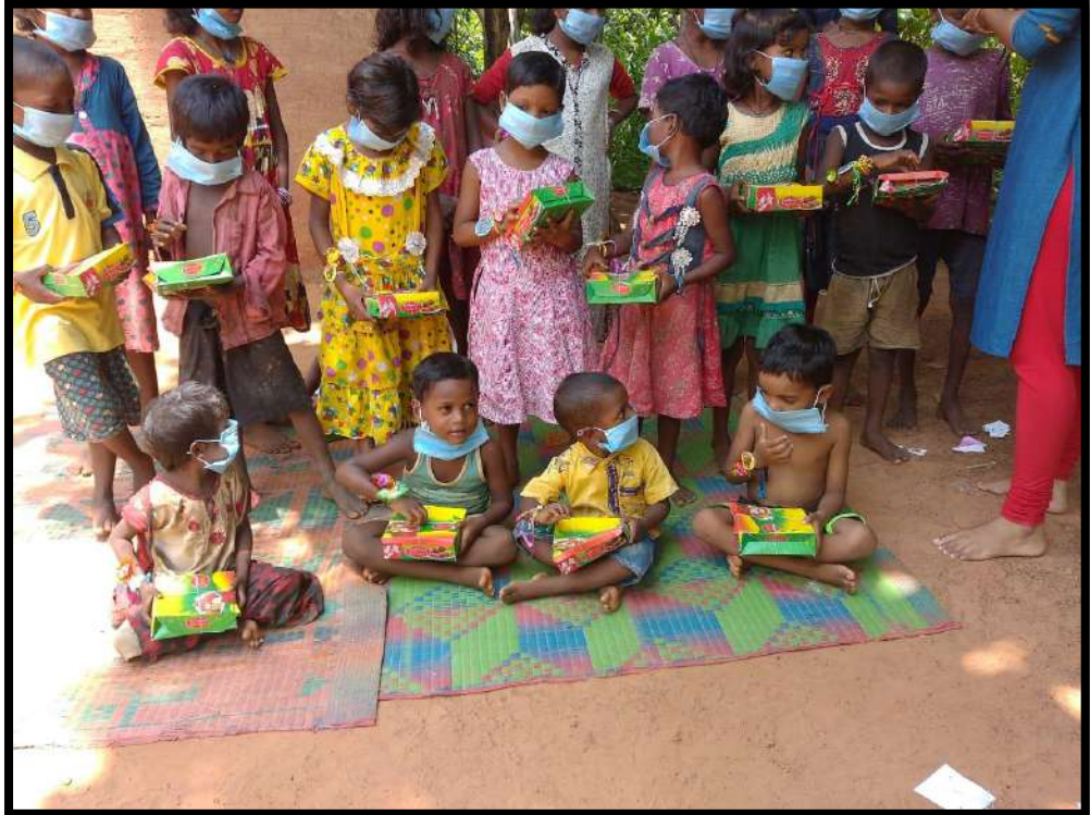
Rakhi celebration in the Pathshala and distribution of food packets

P.O.- Jhargram :: Dist-Jhargram :: PIN-721507 :: Ph: 03221299907