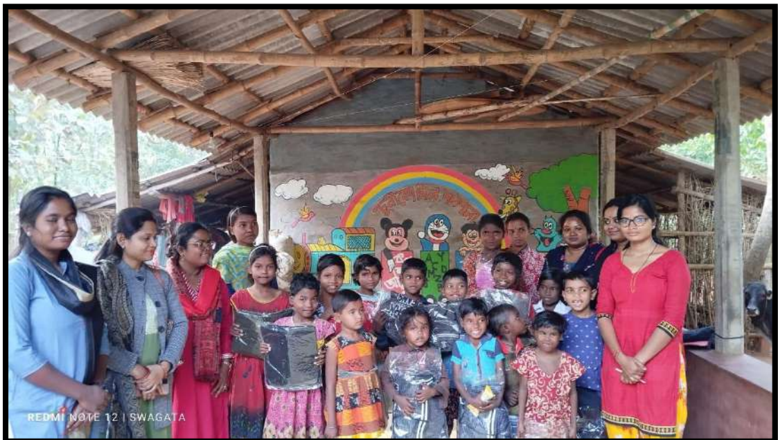
Chunikotal Pathshala at Pukuria village (After renovation)