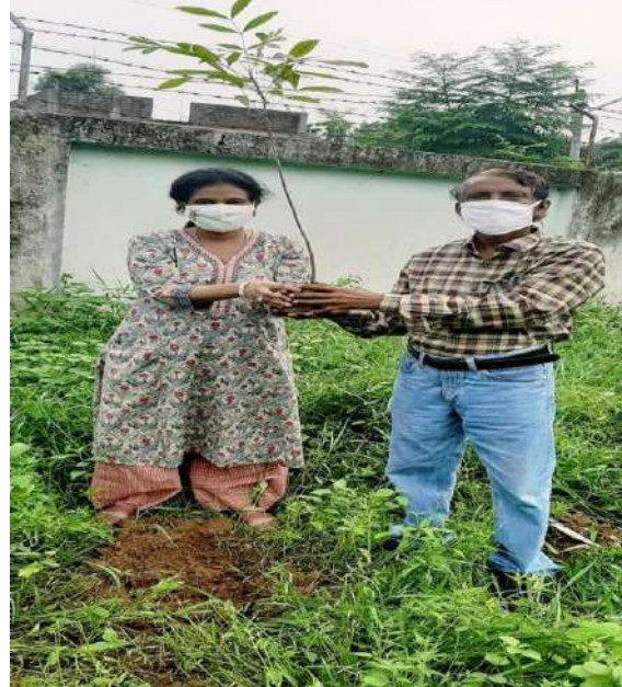
Teachers given saplings for plantation