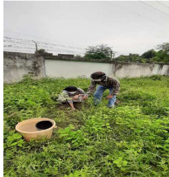
Sapling plantation by teachers in Smriti Van