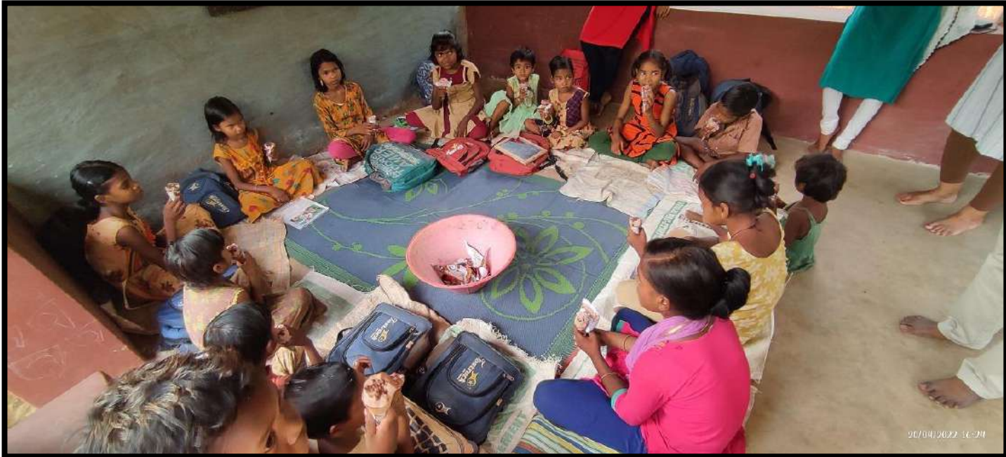
Dessert distribution among the students. They are trained to keep the classroom clean.