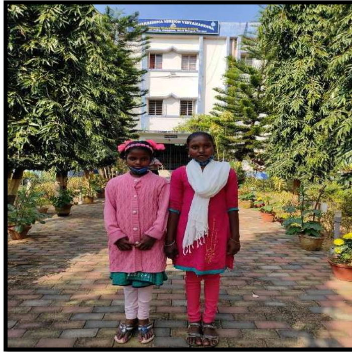
Students admitted to Eklavya Residential Model School under Ramakrishna Mission, Jhargram

P.O.- Jhargram :: Dist-Jhargram :: PIN-721507 :: Ph: 03221299907