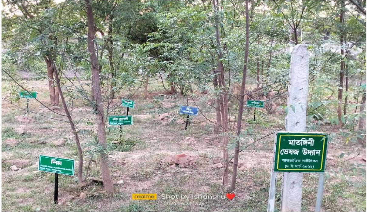
Matingini Bhesoj Udyan (Medicinal Plant Garden)

P.O.- Jhargram :: Dist-Jhargram :: PIN-721507 :: Ph: 03221299907