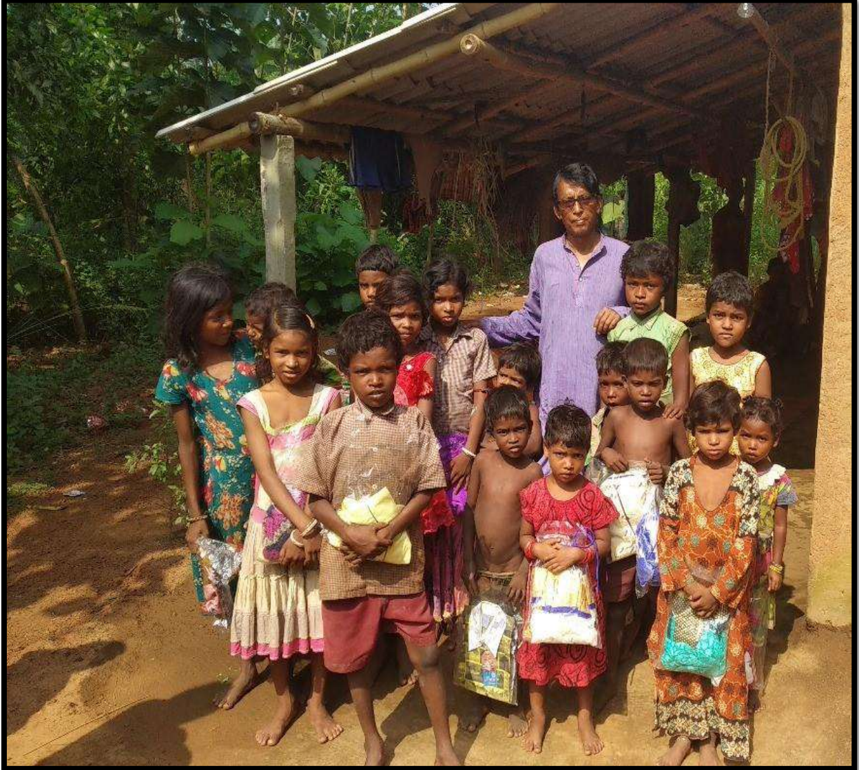
Chunikotal Pathshala at Pukuria village (Before renovation)