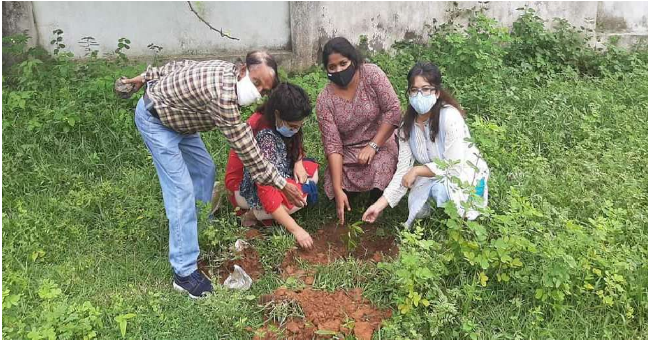
Sapling plantation by teachers and Officer-In-Charge of our college

P.O.- Jhargram :: Dist-Jhargram :: PIN-721507 :: Ph: 03221299907